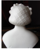
Isabel Item#: K603

China or parian with beautiful molded hair and snood. Doll size: 20—21"