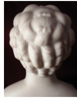
Mary Augusta Item#: K604

China or parian shoulderhead with molded hair and soft curls decorated with bows. Doll size: 18" (45.7cm)