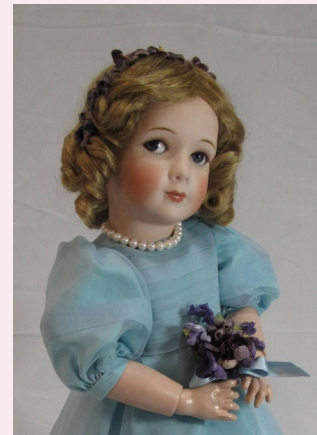
Princesse Jumeau France Item#: K101

Marked 71 Unis France 149, 306 Jumeau Flirty/Sleep eyes. Doll size: 15.75" Head circumference: 9 7/8"