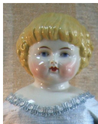
Highland Mary II Item#: K611

Circa 1880. May be made as a Parian with glass or painted eyes. Also found as china. Doll size: 20"