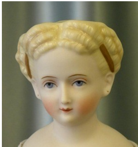
Parthenia Item#: K607

Elegant classic lady may be made as a china or parian. Unique Grecian style molded hair. Pierced ears. Doll size: 12—14" Arm mold: A9605 Leg mold: L9636