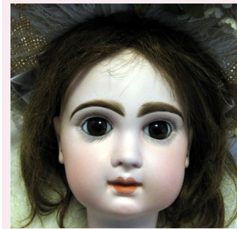
Tete Jumeau Marielle

Also available : Composition body: FB16S KA9105 Lower arm mold to fit FB16S KALS9105 Arm, leg, shoulderplate mold set